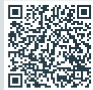
Here To Everywhere Giving Page

Go - Be intentional with the friend you're praying for by using the STAR Tool.